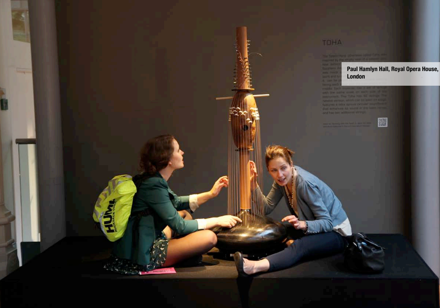
Paul Hamlyn Hall, Royal Opera House, London