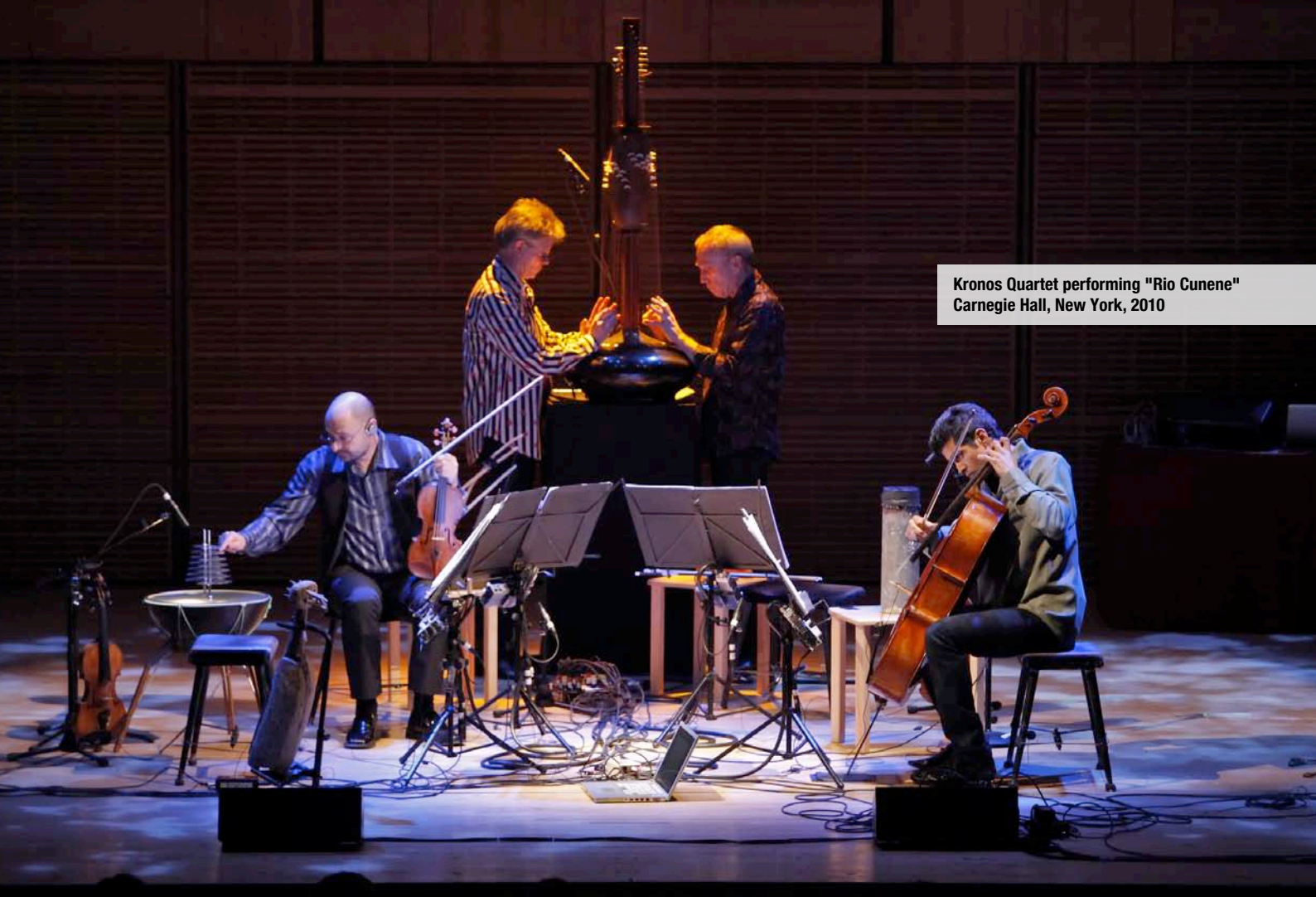
Kronos Quartet performing "Rio Cunene" Carnegie Hall, New York, 2010