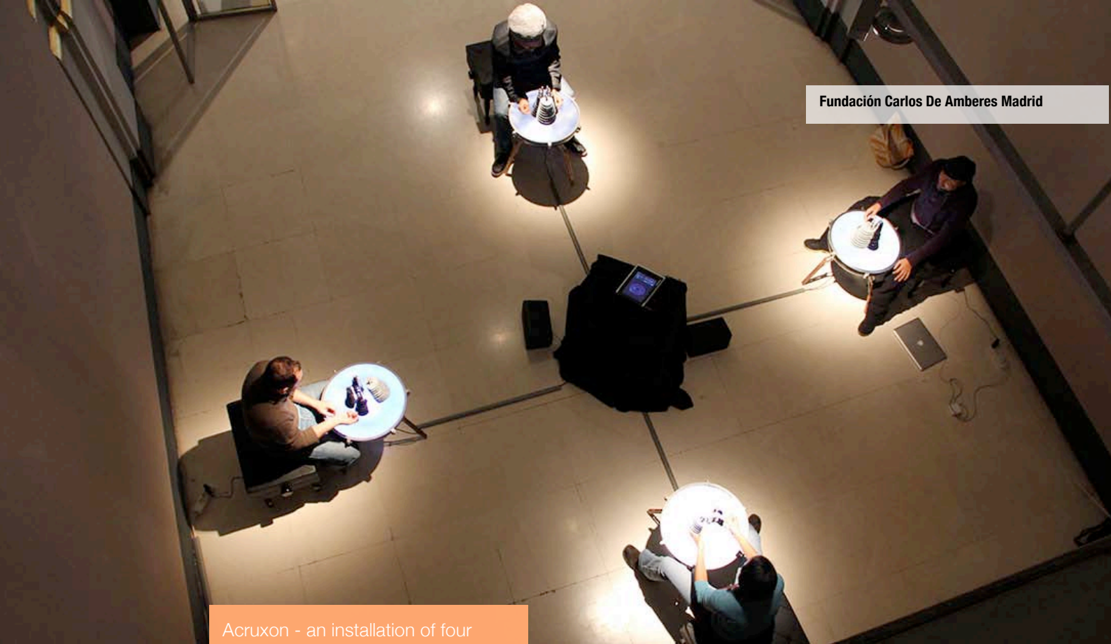
Acruxon - an installation of four acruces to be played by the public